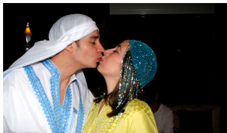
Fun On Galabaya night